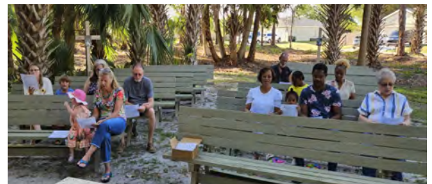
Holy Saturday Service