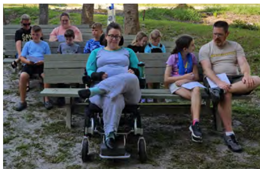
Holy Saturday Service