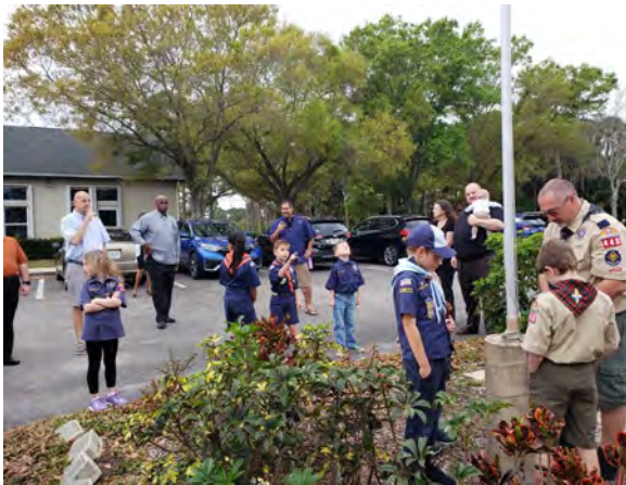
Flag Raising Ceremony with Scouts In Honor of Tuskegee Airmen by Neville Lake