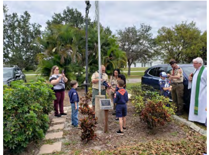
Flag Raising Ceremony with Scouts In Honor of Tuskegee Airmen by Neville Lake