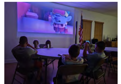
Parents Night Out