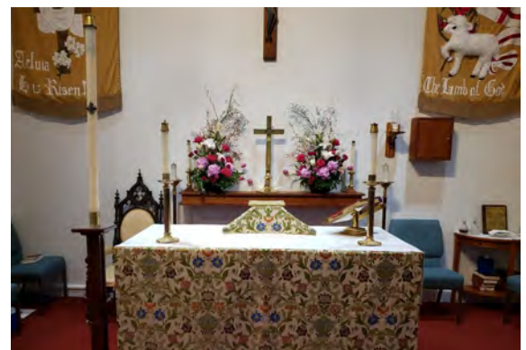
Some of our creations