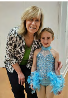
Parents Night Out