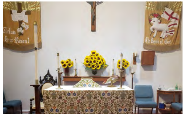
Some of our creations