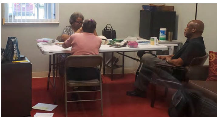
Observation by CPA as he audits our records and processes.