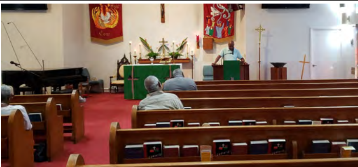
Vasco leading the Wednesday Service