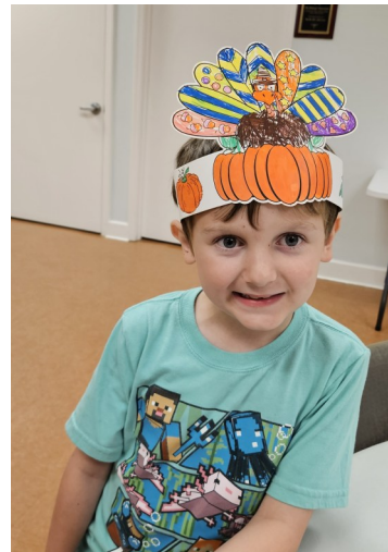
Parents' Night Out