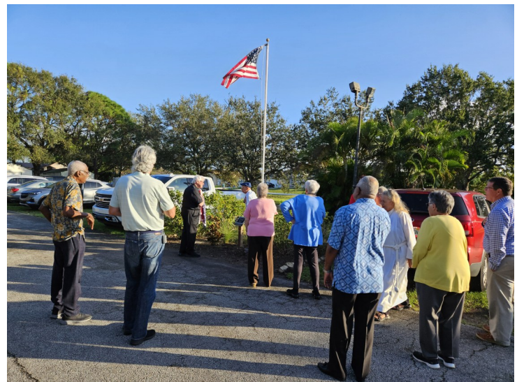
Veterans' Day Flag Raising