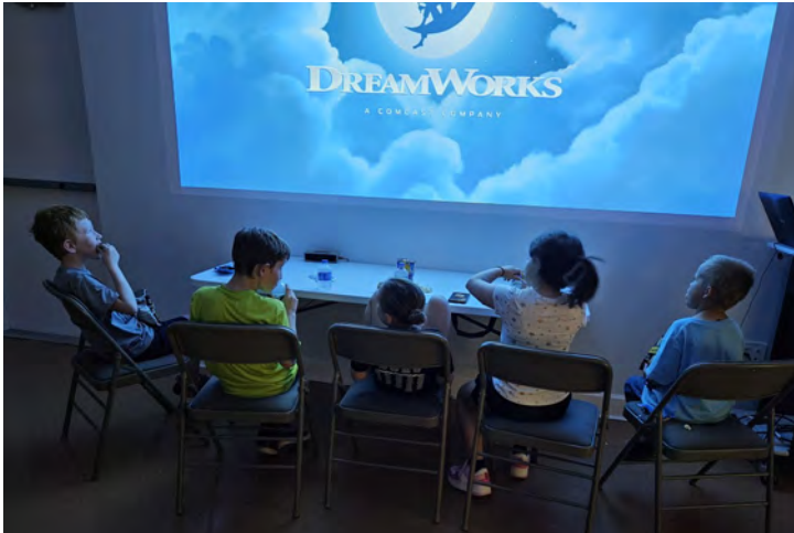
"Movie and popcorn time during our May Parents Night Out"